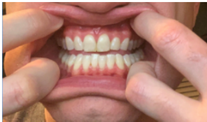
Front teeth, Lip side

Please look at the following 3 pictures as a guide to the photo that we will need for your teledentistry visit, including additional ones of any area of concern.