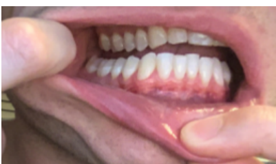
Cheek side of teeth, upper and lower