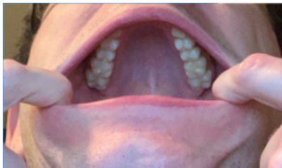
Upper back, Chewing side