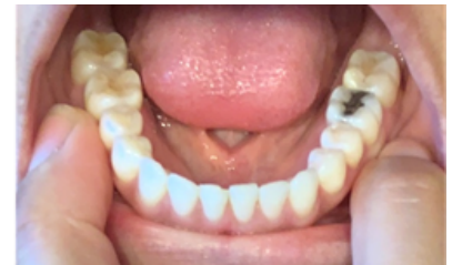
Lower teeth, Chewing side