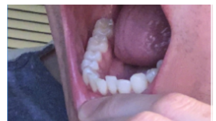
Bottom teeth, Tongue side